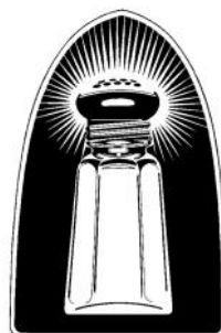
CALLED TO BE SALT