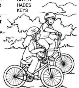
I can tell my friends about Jesus.

CHRIST BLESSED LIVING JOHN SON CHURCH FATHER PETER PEOPLE BAPTIST ELIJAH JEREMIAH EARTH KINGDOM ROCK HEAVEN PROPHETS GATES HADES KEYS